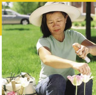
1- 2 hours