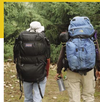
5 – 8 hours